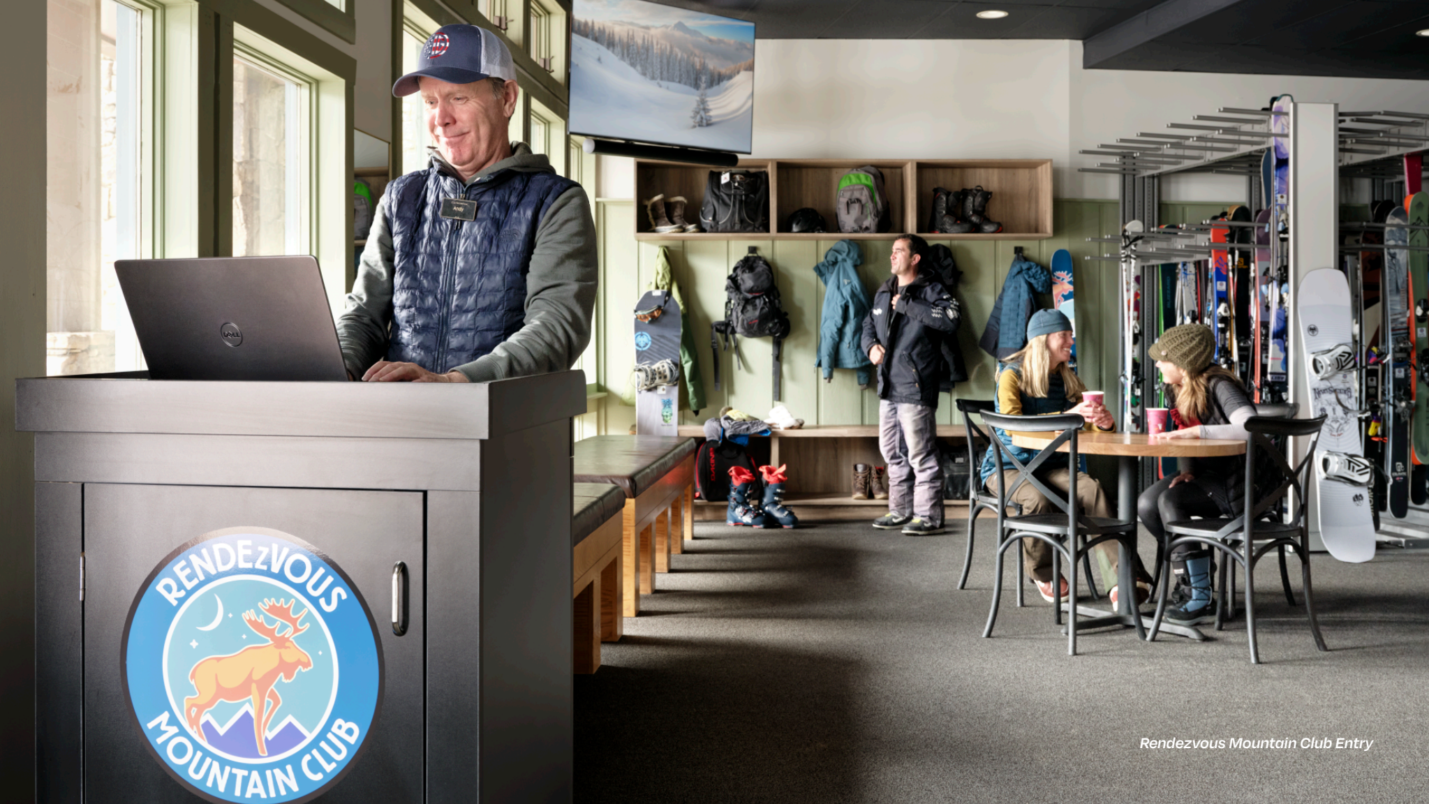
Rendezvous Mountain Club Entry